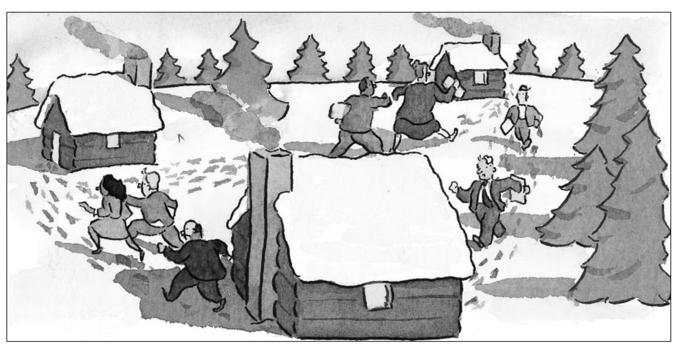
Call an informal retreat "planning," let conventional planners organize it, and watch how quickly the event becomes formalized.

Such strategies often cannot be developed on schedule and immaculately conceived. They must be free to appear at any time and at any place in the organization, typically through messy processes of informal learning that must necessarily be carried out by people at various levels who are deeply involved with the specific issues at hand.